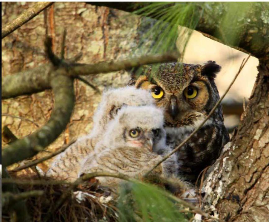
Backyard Hermit Thrush and Great Horned Owl and owlets